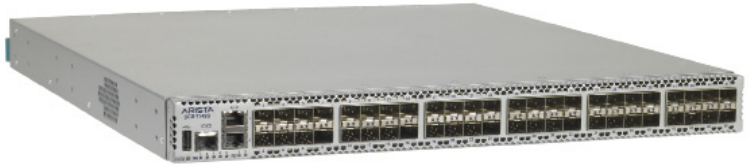
Arista 7148S: 48-port 10 GbE 800 Gbps, 600 Mpps, L2/3/4, 1U Switch (SFP)