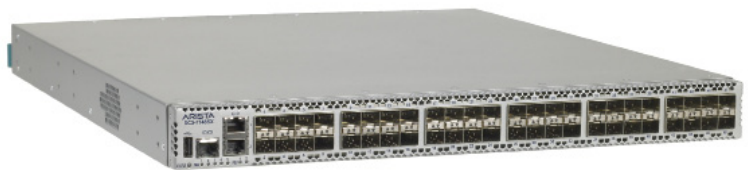
Arista 7148SX: 48-port 10GbE 960 Gbps, 720 Mpps, L2/3/4, 1U Switch (SFP)

The Arista 7100 Series is a family of high performance, very low latency layer 2/3/4 10 Gigabit Ethernet data center switches. Offered with 24 and 48 ports in a compact 1RU chassis with redundant power and cooling, the Arista 7100 Series features front-to-rear airflow when mounted in either direction for flexible rack-top server aggregation deployments. All ports accommodate the full range of 10GbE SFP+ or GbE SFP optical or copper physical layer options, allowing for maximum flexibility and investment protection as customers of all sizes migrate their server connections from Gigabit to 10 Gigabit Ethernet.