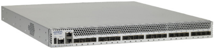
Arista 7124S: 24-port 10 GbE 480 Gbps, 360 Mpps, L2/3/4, 1U Switch (SFP)